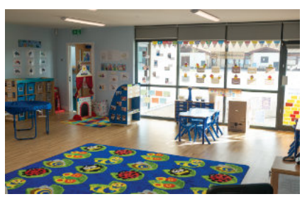
There's lots of light inside the new classroom

This has now been completed, and the children have finally been able to