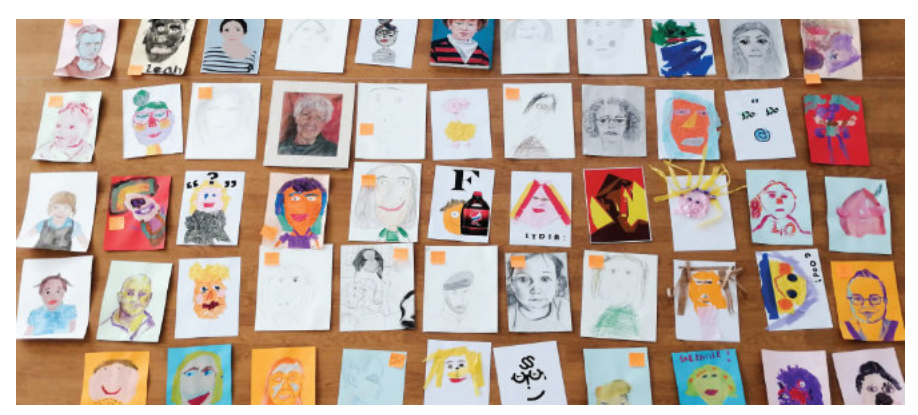
Some of the portraits created by local residents for our Faces of St Neots project at Love's Farm House

foyer at Love's Farm House from Saturday 6 April. Please join us for our exhibition launch event — like a private view except everyone's invited. The portraits look great on their own and even better when seen together. It's a beautiful snapshot of the people who make up our community — and their artistic talent.