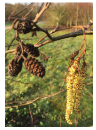
Alder catkins and cones

There are lots more to tell you about, but next time perhaps. Tell me if you spot something interesting as spring springs!