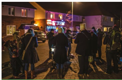
Bobble hats at the ready for our carol singing evening

A highlight of our year. Join us on 17 December for our annual Love's Farm carol singing. Meet at Love's Farm House at 6pm to warm up our voices. Then we walk around Love's Farm and stop to sing to residents. Keep an eye on the LFCA Facebook page for the route this year. We hold lanterns designed by the Love's Farm Brownies and finish with mince pies and mulled wine at Love's Farm House at 7:30pm, hosted by Love's Farm Guides. Everyone welcome.