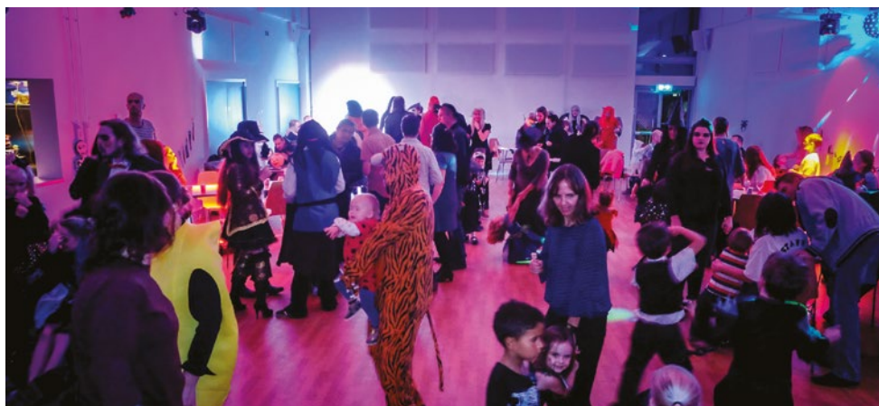
Welcome 2016 with a bang at our family-friendly New Year's Eve party at Love's Farm House