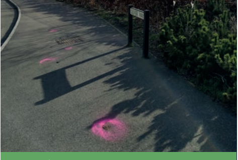
A slalom of doggy do on the path beside our primary school.

Plans are well underway for the day which will include epic exercise and fitness advice from Love's Farm Runners, tennis taster sessions, an ex-Cambridge Ladies Cricketer hosting a game of cricket, petangue will be back and there'll be old-style sports day fun, plus bouncy castles, side stalls and more hosted by groups from across our community. The afternoon will conclude with a mile long run, jog, scoot, walk, shuffle from the school field to Love's Farm House where the fun will continue with live music from an assortment of local Love's Farm buskers (feel free to bring an instrument) and a BBQ and bar. Please get the date in your diary.