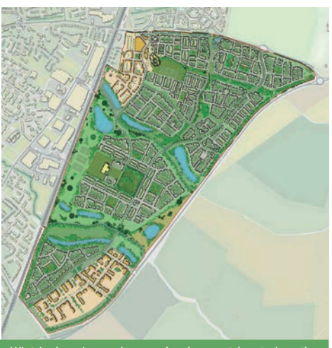
Wintringham is a major new development, located south of Love's Farm (shown at the top-centre of this map).