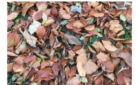
Beech leaves — try to count the colours

Back to Love's Farm! We planted lots of tulip and narcissi bulbs this weekend and have more to do, so I hope we'll have some patches of colour next spring. I've had a lot of comments about the tree-guards and