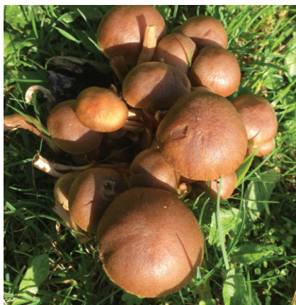
Beware — unidentified mushrooms!