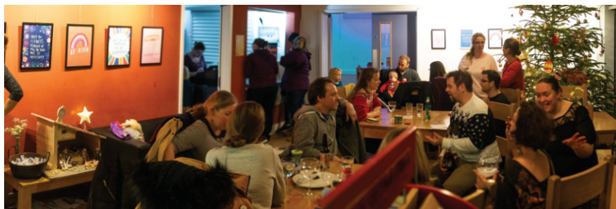
Christmas Cheers at the Farm House Bar, Friday 20 December from 6:30pm at Love's Farm House