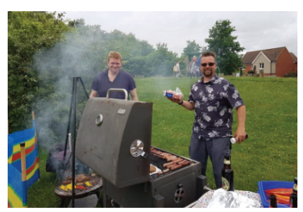
Barbecued bangers on the marshy moor

said how wonderful it was to play together again and the adults enjoyed sharing food over the hot BBQ coals and a (soft) drink or two as we got to chat late into the evening.