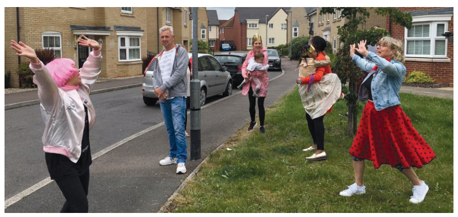
We all need to find our own way to reconnect as we come out of lockdown. This is certainly one approach.

Over the Great Get Together weekend of 18-20 June, Love's Farm did exactly that. Despite the rain, spirits were un-dampened as outdoor gatherings went ahead and folks reconnected after months of staying in, as well as meeting some of the new arrivals on the farm.