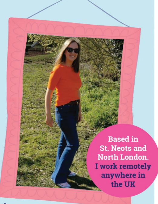
After weight 9st 7lb

If you'd like to book a free consultation or just find out more, please text or call: