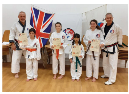
Students at Love's Farm Tang Soo Do karate club show off their certificates and new belts

A group of young students of Love's Farm Tang Soo Do karate club recently passed their grading and moved up to a new belt. Very well done to all those concerned. The club meets on Wednesdays, 5.30-7.00pm, and is open to all ages and abilities. Contact Paul on 07790 217170 for more details.