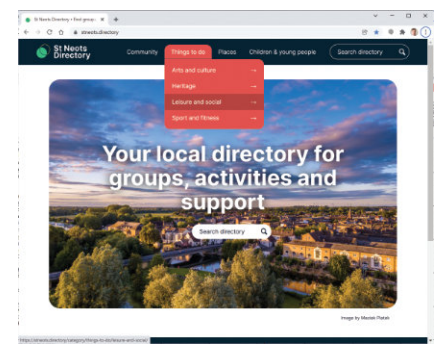
The St Neots Directory covers 195 (and counting) community groups and activities across our town.

LFCA has launched an online directory of community groups, services and activities for St Neots, available at www.stneots.directory.