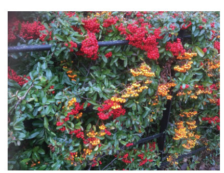
Still a few Pyracantha berries left in the Blackbirds' larder

spearhead our understanding, to the point that the more we know the more we realise we don't know, and it is scary.