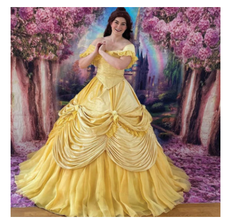
All dressed up: Princess Belle will be making an appearance at the Valentine's Ball, 17 February

Join Inspirations School of Performing Arts this February Half-Term for two Acro & Street dance holiday clubs. The clubs are open to all children aged 4-15 years, not just those who attend their term time classes, and for all abilities. Sessions will involve a mix of Acro and Street Dance, arts and crafts, games and activities. Children will need a water