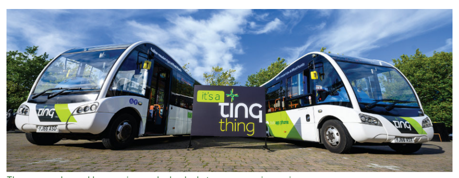
The new on-demand bus service can be booked at your convenience via an app.

We haven't been served by a bus that comes into Love's Farm since the very early days of the development, but if you look carefully you'll notice the infrastructure — including a number of bus stops and the long decommissioned bus gate at the top of the Hogsden Leys. Until recently, the only public transport available into the centre of town is the expensive X5 / 905 from Cambridge Road.