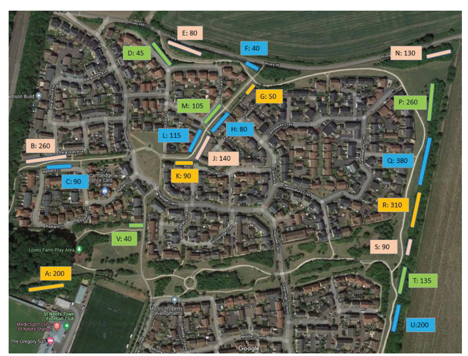
The finish line is in sight for the removal of thousands of tree guards from across Love's Farm's green spaces.

The map below shows the number of guards remaining in 20 locations across the north of Love's Farm. We'll post it on the LFCA website so you can see what needs doing. Two