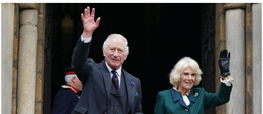
Raise your hand if you're up for some litter picking — His Royal Highness is encouraging people to get involved in their local community as part of the Coronation celebrations

The forthcoming Coronation celebrations conclude with an extra bank holiday on Monday 8 May. The King is hoping communities will use this day to come together for a Big Help Out. That seems like the perfect invitation to rally volunteers from across our own community and do a mega clear up of our shared spaces and green places.