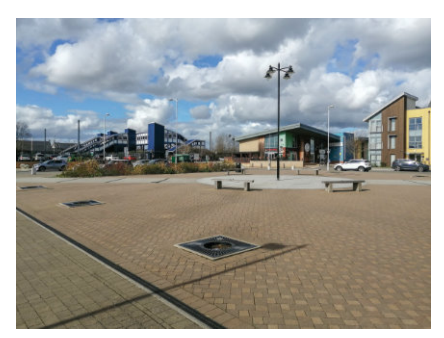
Station Square is still a bit of a blank canvas. Could you help bring it to life?

involved then please get in touch with marcus.pickering@ ourlovesfarm.co.uk