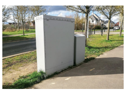
The new cabinets appearing on Love's Farm have been installed by Virgin Media