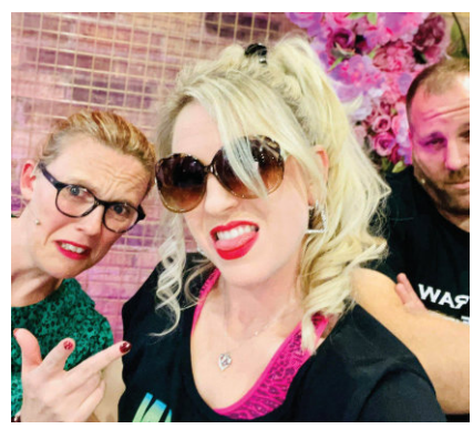
RAW Productions host a night of murder mystery at the Farm House on 15 April

We need YOU to help Inspector Darcy Meltoya investigate the clues, interrogate the suspects and solve