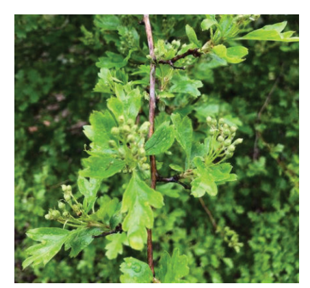
Midland Hawthorn in bud, a bit ahead of its May flowering

because I have some mistletoe babies arriving soon! Like bluebells, I'm told they take several years to get established, so it may be kissing en plein air for years before we can cut our own Christmas supply!