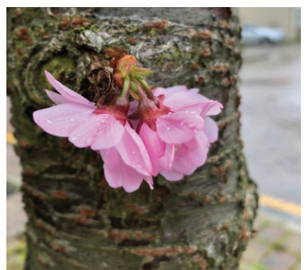
A cherry bud appearing on a tree trunk

So if you see me up a tree, or later some coloured wool around a branch, please look but don't touch