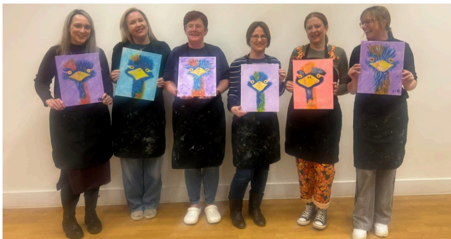
Paint and Sip artists display their emus

The meeting room measures 4.5m x 4.5m and can be used for various sessions including training, education, or a quiet space to work – and yes, meetings! Give us a call today to ask about availability.