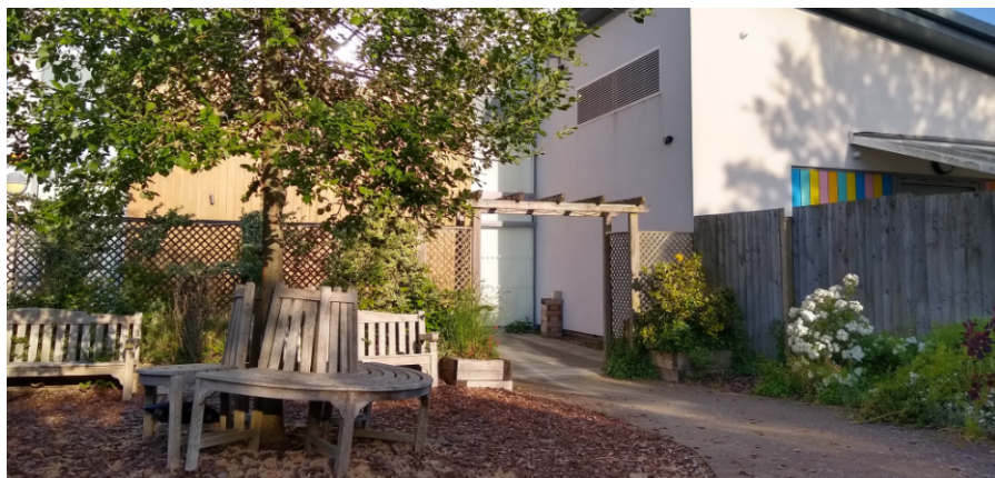
Love's Farm House garden on a sunny evening

The garden at Love's Farm House is always a popular venue in summer, and we've been working hard to get it ready for the sunny weather.