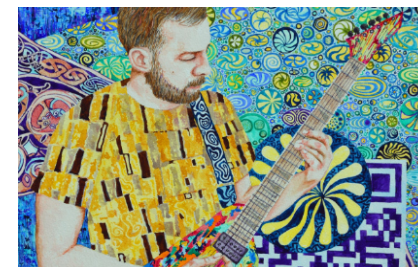
Art by Martin Hatch on display at LFH

Do you know about our Foyer Gallery? It's the perfect place to showcase works of art, with space for eight pieces, seen by our many visitors every day! We are currently exhibiting the work of local