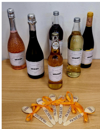
Prizes from the PTA quiz